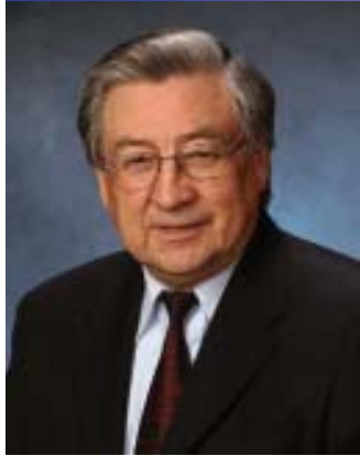
Minister Mike Cardinal Human Resources and Employment