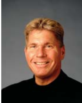
Deputy Minister Ulysses Currie Alberta Human Resources and Employment